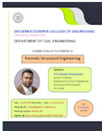
Webinar -23.05.2020.jpg 525K